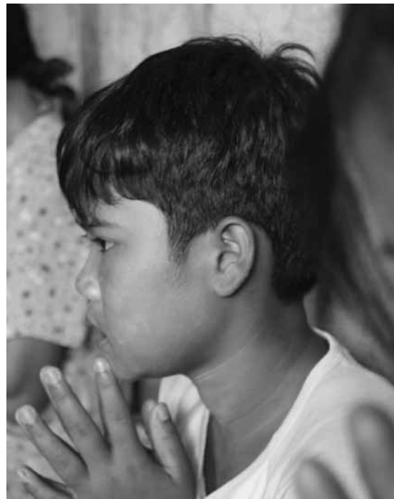
A boy whose parents are migrant workers from Myanmar attends a religious ceremony to remember fellow citizens who died in a tsunami (Thailand).

The profound influence that spirituality and religion can have on children’s development and socialization offers the potential to reinforce protective influences and promote resilience. The beliefs, practices, social networks and resources of religion can strengthen children by instilling hope, by giving meaning to difficult experiences and by providing emotional, physical and spiritual support. When child rights efforts are grounded in the protective aspects of religious beliefs and practices and a community that encourages and enriches the spiritual and religious life of each child, the impact can be far-reaching and sustained.