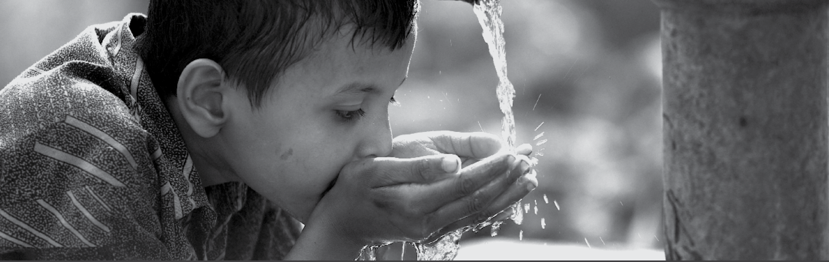
A boy drinks water from a hand pump (Bangladesh).