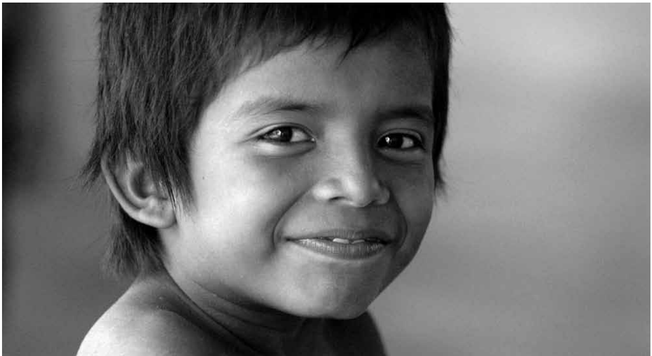
An eight-year-old indigenous boy from an area where UNICEF supports the training of teachers and community leaders to promote traditional languages and customs (Venezuela).

and intercultural education to culturally sensitive health services, birth registration and ending the violence, abuse and exploitation suffered by indigenous children. For example, the UNICEF Regional Office for Latin America and the Caribbean has been working consistently since 2004 with a programme on the rights of indigenous children in 17 country offices to generate strategic information, empower indigenous peoples (primarily women and adolescents) and build the capacity of counterparts (mainly governments) and UNICEF staff.