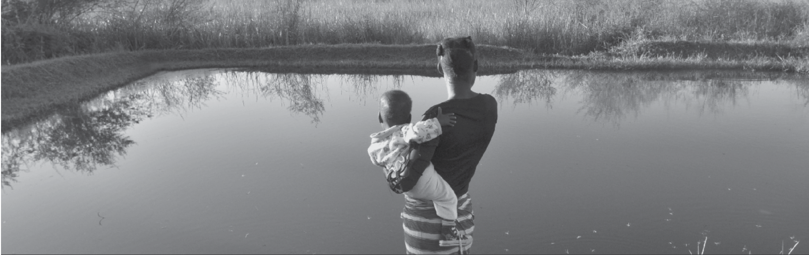
A woman holding her HIV-positive nephew, for whom she is caring after his mother died of AIDS (Zambia).