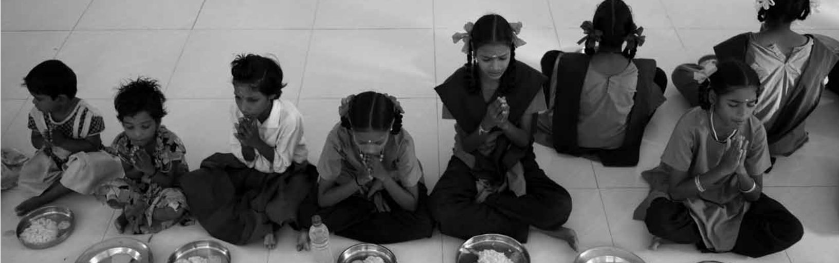
Girls pray before breakfast at the Government Home for Tsunami-Affected Children, which provides care, shelter, basic education and recreational activities for orphans and other vulnerable children, most of whom are from fishing villages (India).