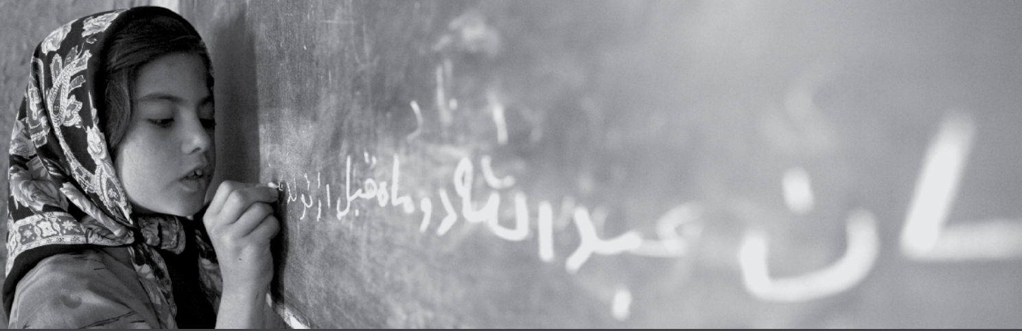
A girl writes on the blackboard inside a mosque that serves as an informal community-based school to which UNICEF provides teacher training, textbooks and other supplies (Afghanistan).