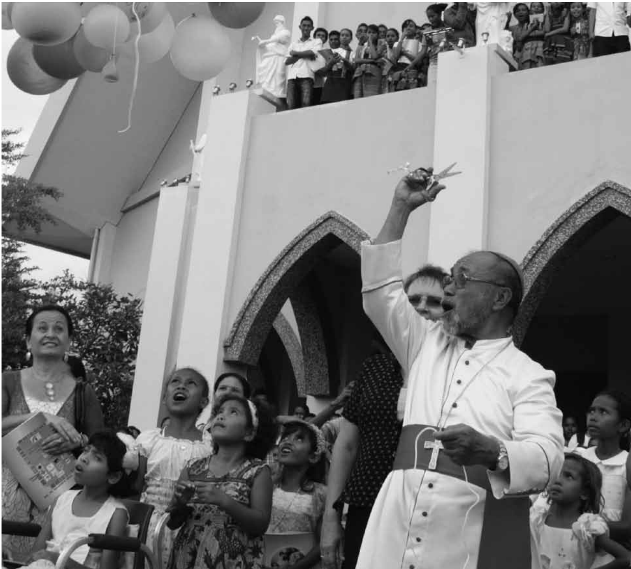
As part of the Day of Prayer and Action for Children initiative, which aims to mobilize religious communities to promote children's rights, the Bishop of Dili along with children and special guests gather in front of the cathedral to release balloons signifying hope for a better protective environment for children (Timor-Leste).