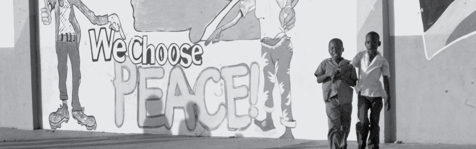
Boys walk near a mural promoting peace at a centre that provides young people in violence-affected communities with a safe space for recreational activities and training in life-skills and conflict-resolution (Jamaica).